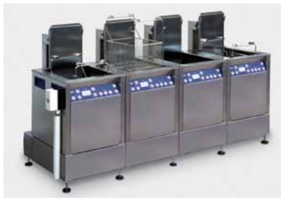
Manual 4-chamber system with oscillation device