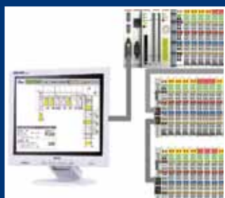
Operating panel designed as touch panel