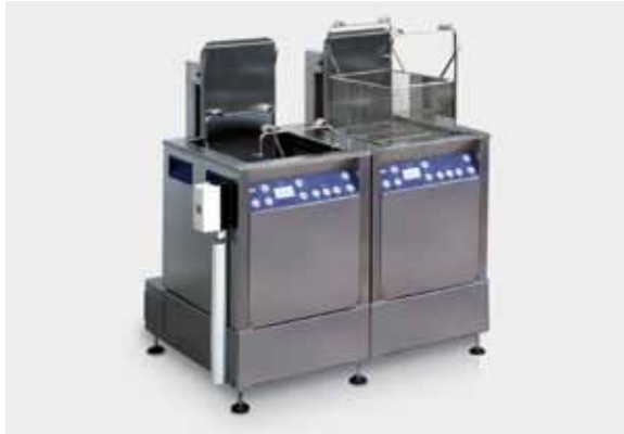
Manual 2-chamber system with oscillation device