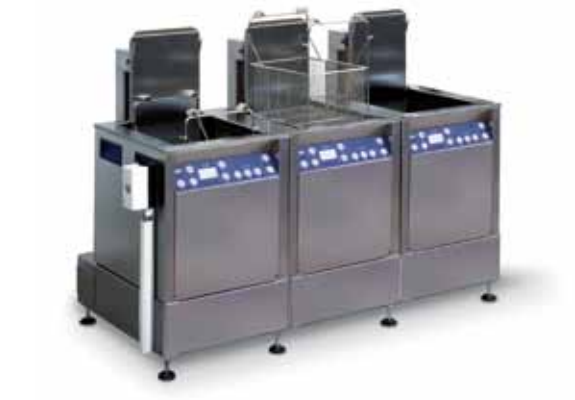
Manual 3-chamber system with oscillation device