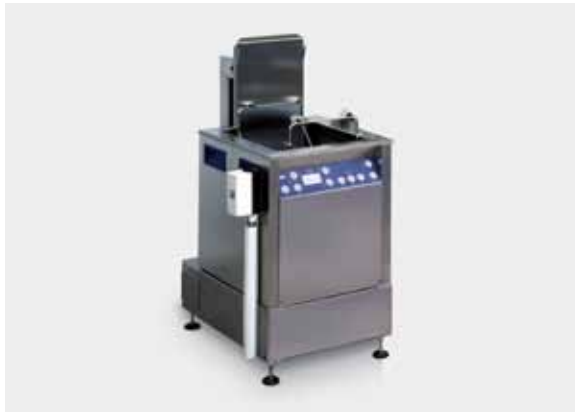
Single unit with oscillation device