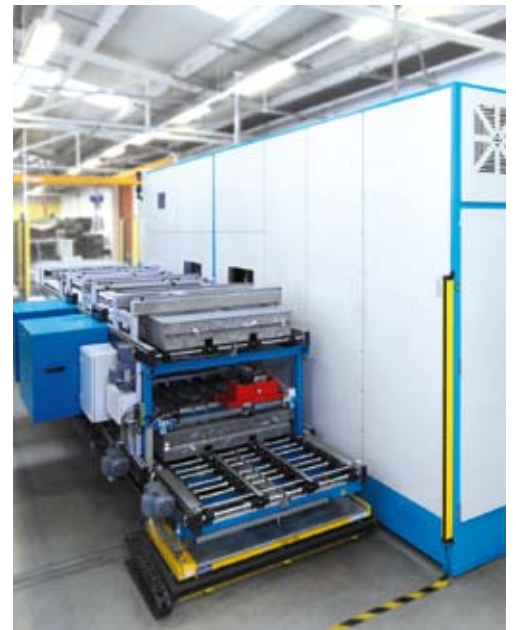
fig. 1 LIMPIO with two working chambers