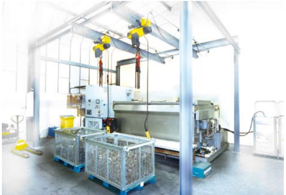
fig. 2 GIGANT TOP-LOADER with double gantry crane