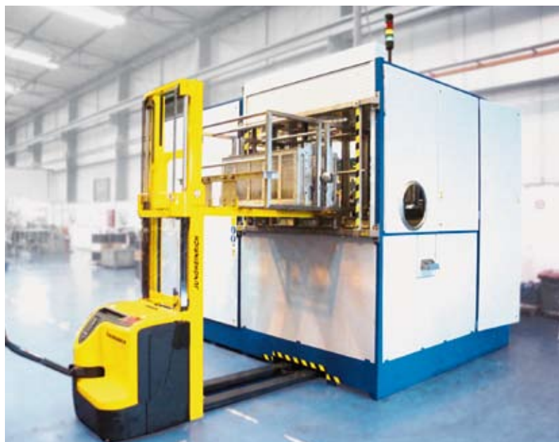
fig. 3 manually loaded GIGANT FRONT-TOP-LOADER